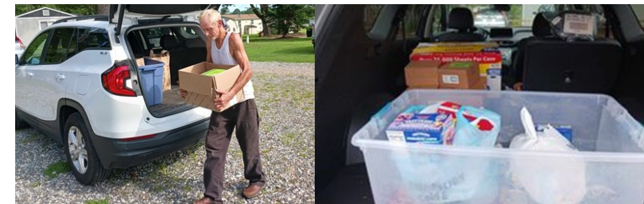
One of our deliveries to Hands Across Mathews.