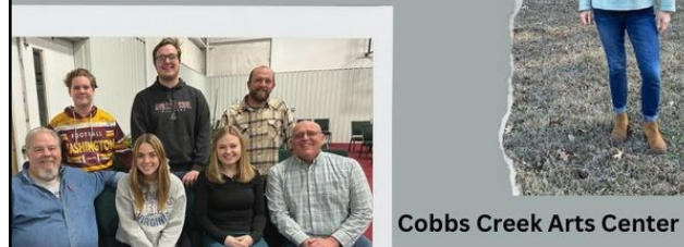
Cobbs Creek Arts Center