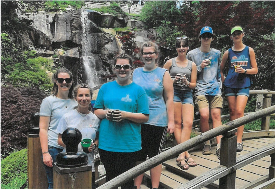
May 15th, the youth went to Maymont Park in Richmond for a hike!