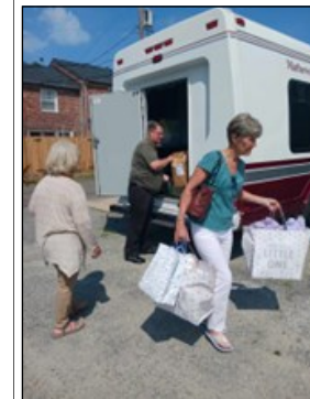
Unloading the bus.

any way possible. Their donation room is full of every kind of need for the new little ones. On our way back to Mathews, we made an unexpected