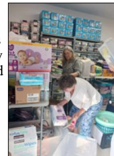
Dropping off items in Donation Center

any way possible. Their donation room is full of every kind of need for the new little ones. On our way back to Mathews, we made an unexpected