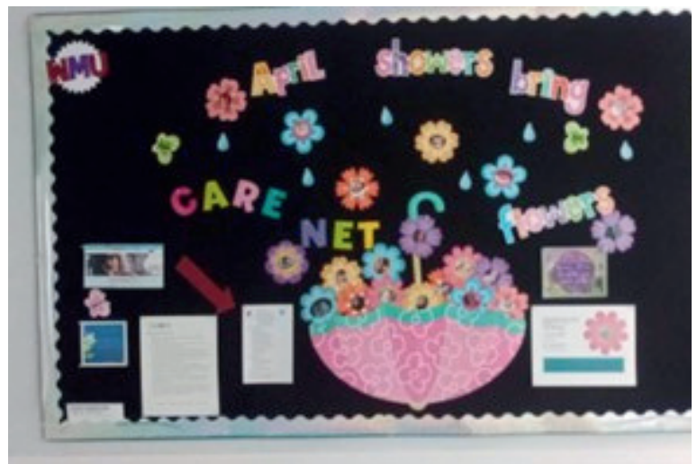
WMU bulletin board – April Showers bring CareNet Flowers.