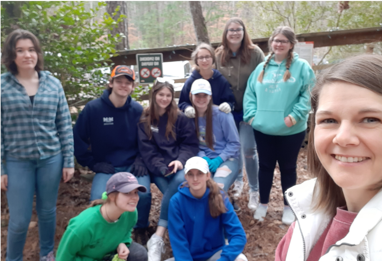
March 4th-6th, we took our annual High School Youth Retreat!