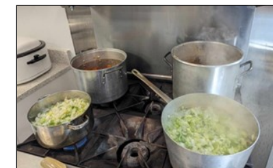
Soup cooking on the stove