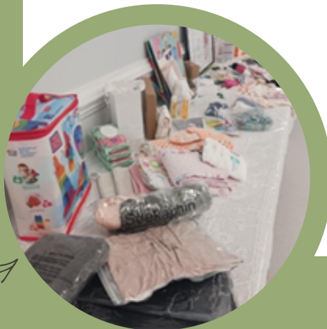
Table full of baby & mother donations

What we aim to do: WMU's unwavering focus is